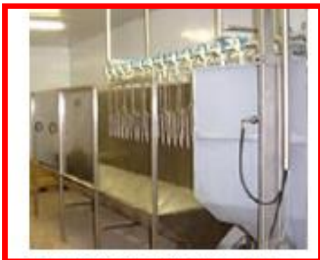
Receiving bay for poultry