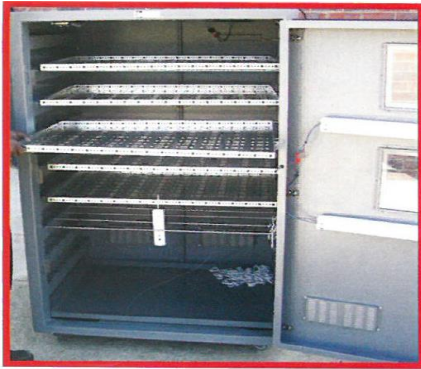
900 Kg Drier