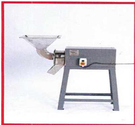
Fruit and Vegetable Mill