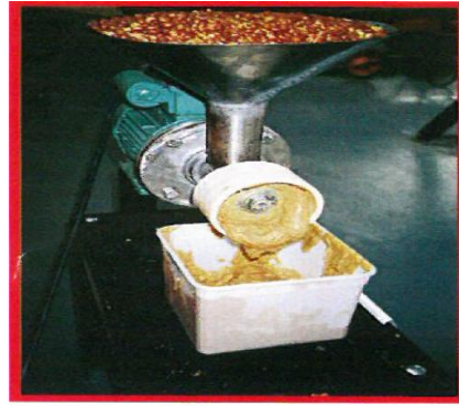
Peanut Butter Machine 30 Kg