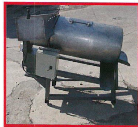
450 Kg P/H Fruit Brush finisher and pulper