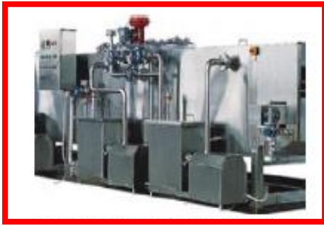
Sterilization and cooling system