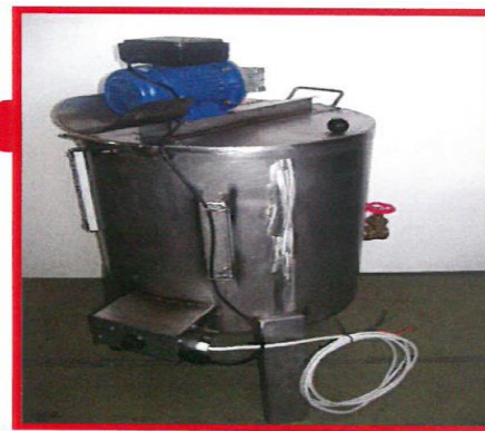
115 Litre Batch Pasteuriser