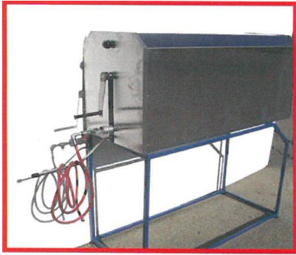
Manual or Electric Turn Gas Roaster