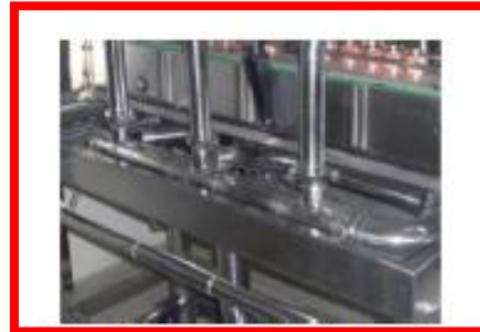
rinsing and drying equipment