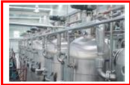
Vacuum cooling system