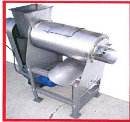
Peanut De-Huller or Brush Fruit Finisher