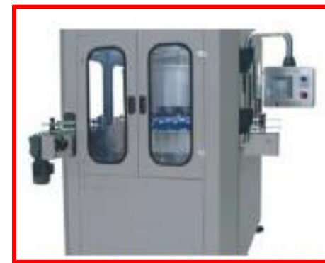
Fruit and vegetable can filler