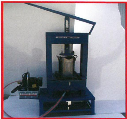
Oil Seed Cold Press